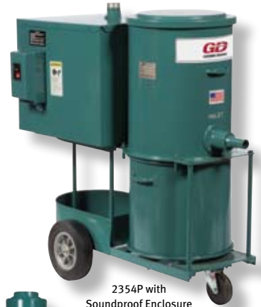
2354P with Soundproof Enclosure