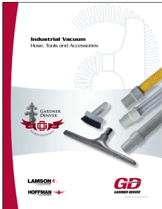
Industrial Vacuum Hose, Tools and Accessories GDCF-1-205