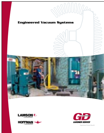
Engineered Vacuum Systems GDCF-1-200