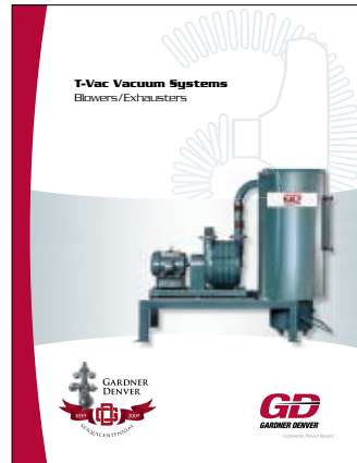
T Vac Vacuum Systems GDCF-1-230